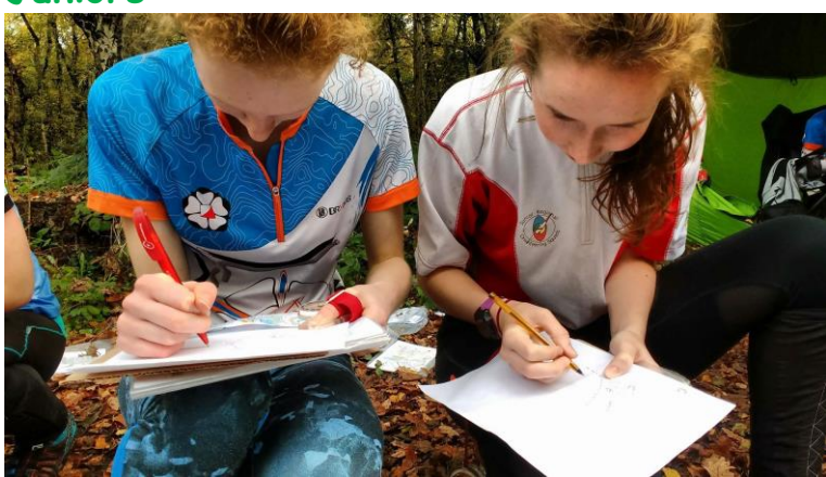
YHOA Squad training