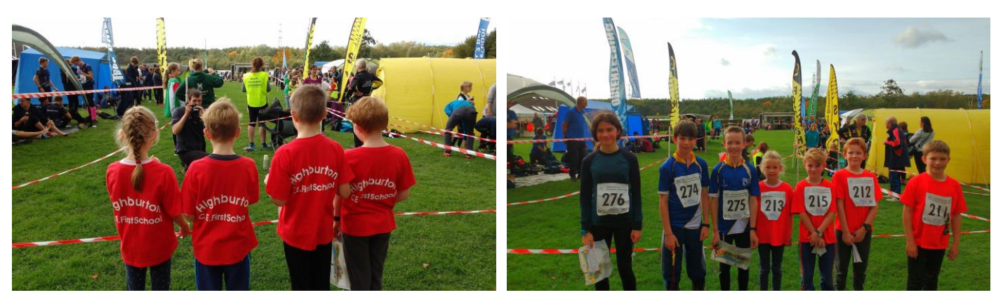
British Schools Score Orienteering Championships